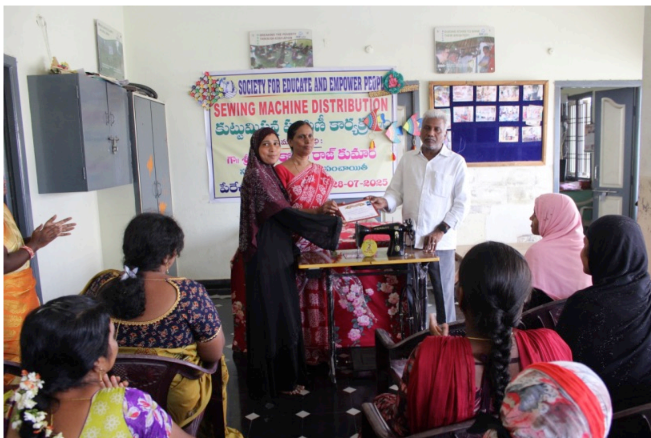
Picture above: Presentation of the sewing machine with certificate. Handed over by the teacher and the head of our organisation in Perecherla.

Incidentally, the sewing machines are always analogue. Remote villages do not always have electricity. The machines, which we consider old, are less prone to breakdowns, cheaper to maintain and also easier to repair.