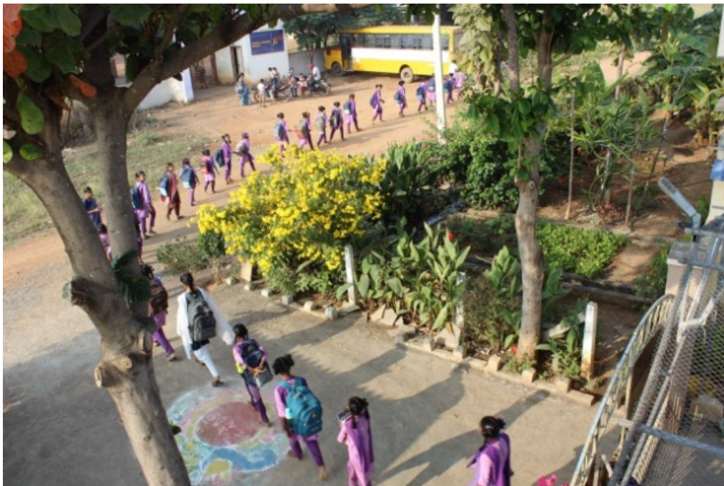
Picture on the left: Our children at the girls' home in Veldurthy set off together in an orderly fashion for the state school, which is a 10-minute walk away.

In a direct comparison, old Europe lives up to its name, although it should never be forgotten that growth is always much more difficult in already highly developed regions than in emerging markets. However, we welcome the positive development in India.